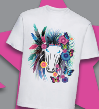
Cotton & Polyester