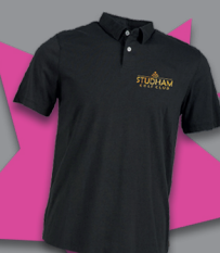
Pique & Wicked Fabrics