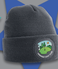
Caps & Hats