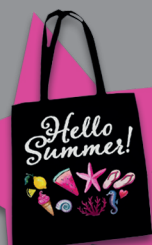
Bags & Holdalls